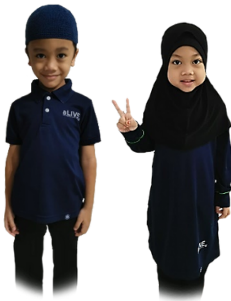
Fig 2.1 Male and female students' attire

For female students, they can pair with their own black pants and black headscarves. Tight-fitting pants or leggings are not appropriate for madrasah.